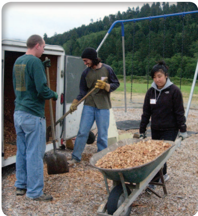
Students in Service members from Humboldt State University

"Students in Service allows California college students to serve their community, learn valuable workforce skills and earn an education award to help pay their college tuition or loans. Students in Service members also recruit thousands of their peers to perform public service. At a time when California budget cuts have hit every level of public service, Students in Service members create a way for our communities to augment otherwise strained services offered by local nonprofits. We need to grow the next generation of public servants through this program."