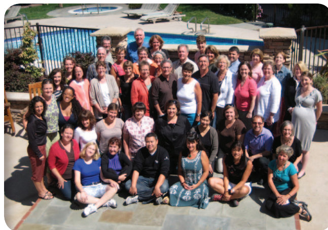
Diving Deep participants and facilitators