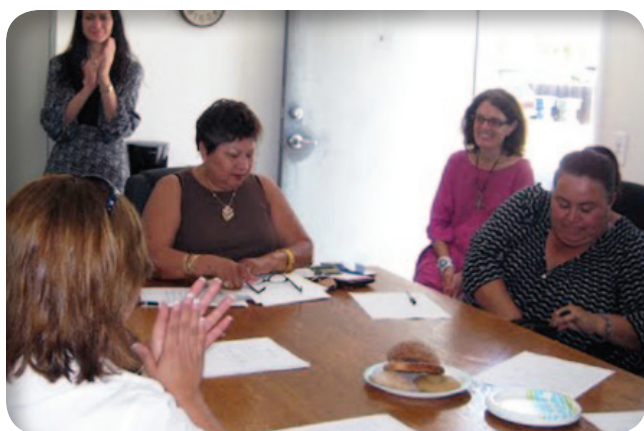
San Diego Microenterprise Project

University of San Diego has created the San Diego Microenterprise Project (SDMP) in partnership with nonprofit organizations and other higher education institutions in the region. SDMP is working with 40-plus inner-city social entrepreneurs to form lending groups and provide assistance from student “social enterprise advisors” in conjunction with experienced microbusiness consultants to develop business plans, marketing plans and finance systems.